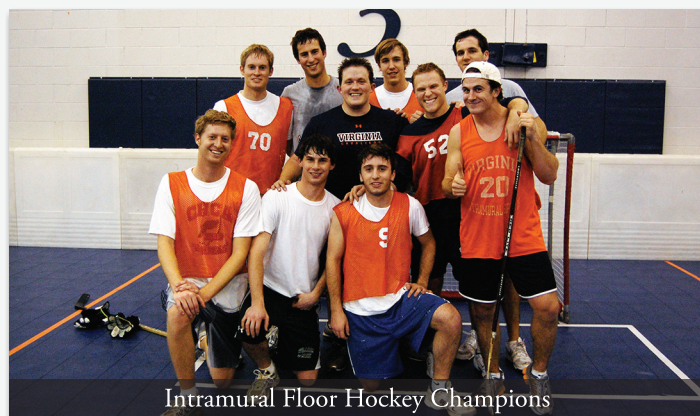
Intramural Floor Hockey Champions

Outstanding Service to Community Outstanding Philanthropy Outstanding Faculty Advisor Outstanding Chapter President Outstanding Contribution to University