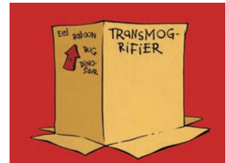
Become anything you believe in Calvin & Hobbes Transmogrifier Box