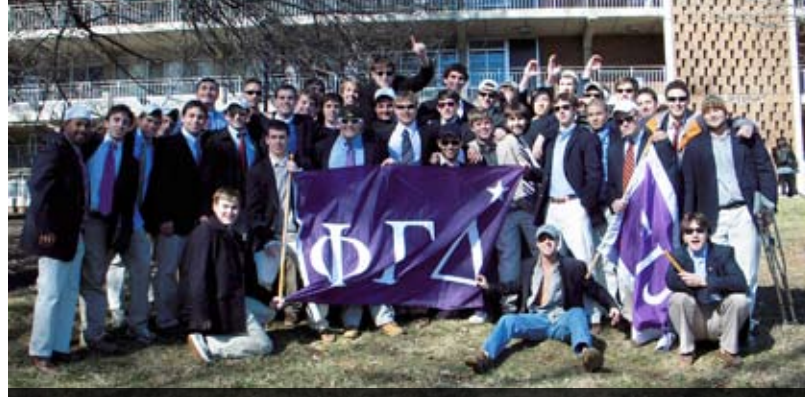
Brothers celebrate a successful Spring 2009 Rush