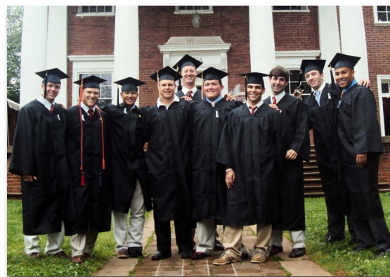
Fourth-Year FIJI's take a picture at the House before walking the Lawn