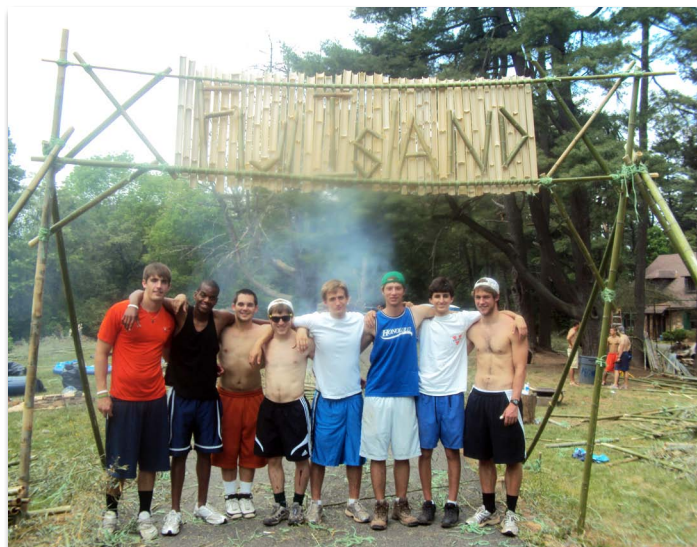
The Spring Lings gather to begin building Island

Please join us Oct 15 th - 16 th for the Annual Frank Norris Pig Dinner and Homecoming Football Game against North Carolina. More details available on www.uvafiji.org .