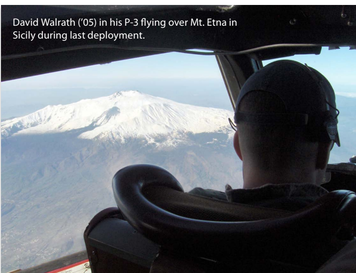
David Walrath ('05) in his P-3 flying over Mt. Etna in Sicily during last deployment.

Update your address information and let your pledge brothers know how you are doing!