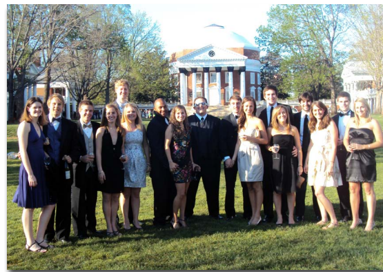
Brothers and dates pause for a photo on the Lawn before heading to Formal