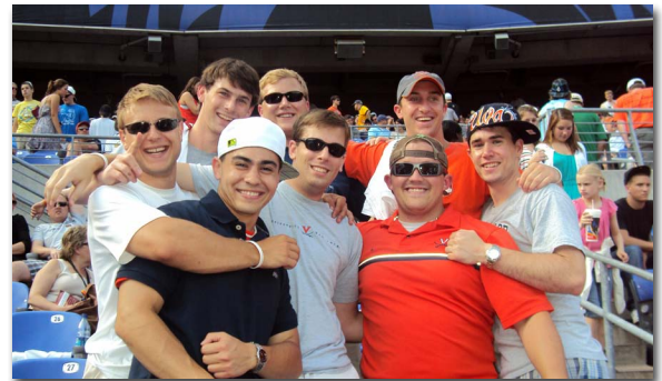
Graduates and Brothers together at NCAA Lacrosse Final Four in Baltimore