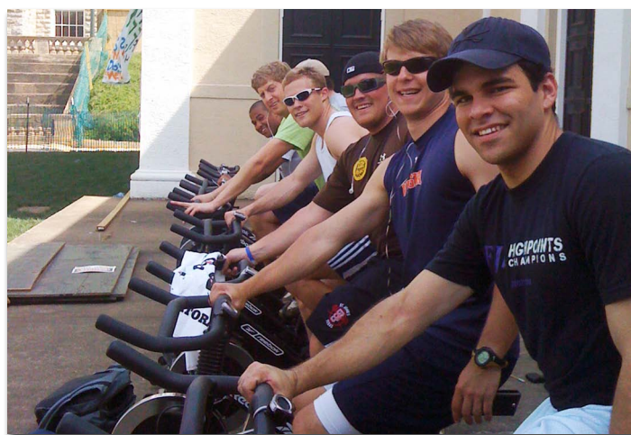
Phi Gams participate in "Bike to Uganda"