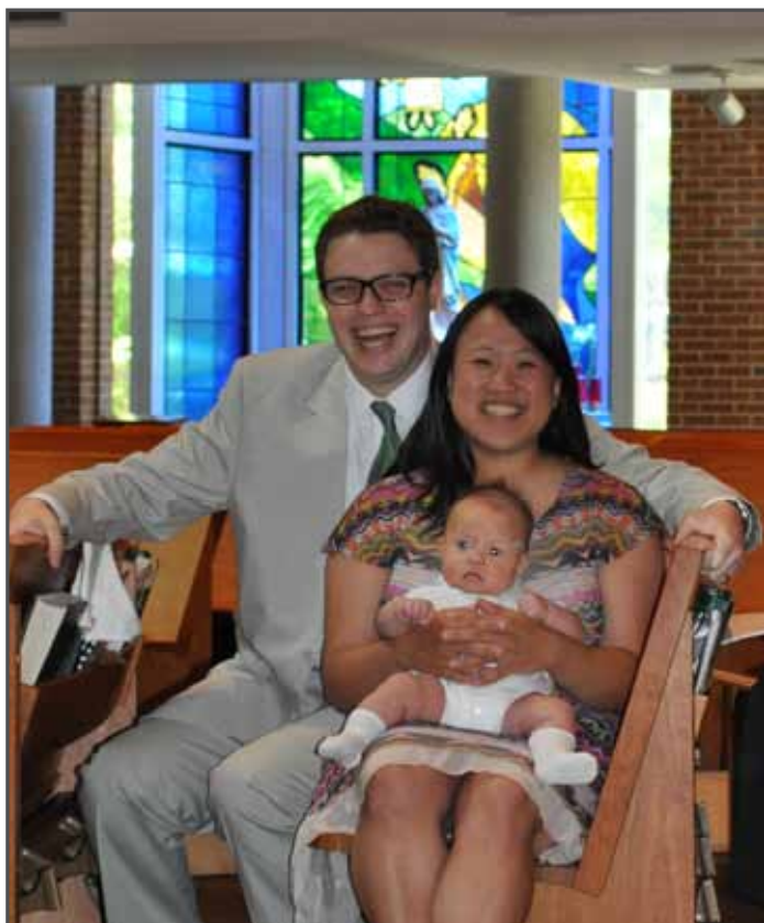
A 128 BABY!