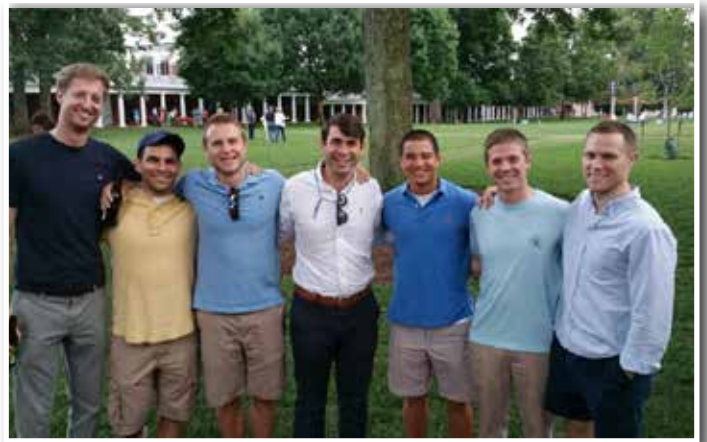
Members of the Class of 2010 convene on The Lawn during Reunions Weekend